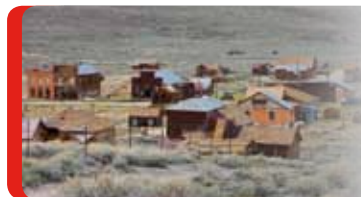
Remote Farms/ Communities

The IsatPhone Pro handset, fits securely in the dock which is also key lockable, other features include phone charging, USB data* port, in-built ringer and allows antenna and power to be permanently connected to the dock ready for use. The IsatPhone Pro handset is easily inserted and removed by the press of a button on the top of the dock making it very easy to use away from the dock when required.