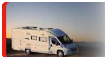
Recreational Vehicles/ Motor Homes