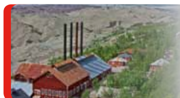
In Building - PBX Integration