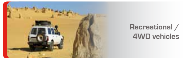
Recreational / 4WD vehicles

IsatDock DRIVE also supports the use of an optional active privacy handset, that can be easily added to the IsatDock DRIVE.