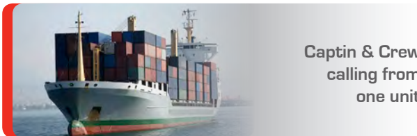
Captain & Crew calling from one unit